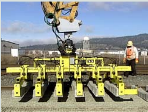
Efficient installation using hydraulic clamp