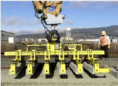
Efficient installation using hydraulic clamp