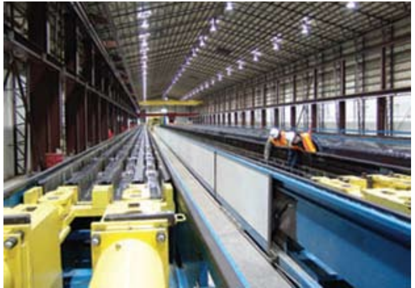
Grand Island ISO 9001:2000 and PCI Certified Facility

Chuck Parks - Territory Sales Mgr. P: 509.921.8736 / M: 509.209.1624