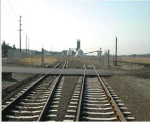
Ties on industrial spur

Easier installation, fewer required ties per track mile, greater life expectancy and reduced maintenance equals substantial life cycle cost savings.