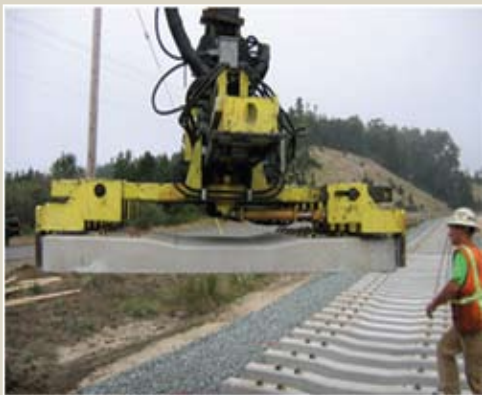
Efficient installation using hydraulic clamp