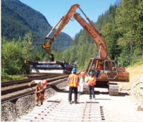
Ideal ties for mainline track

Easier installation, fewer required ties per track mile, greater life expectancy and reduced maintenance equals substantial life cycle cost savings.